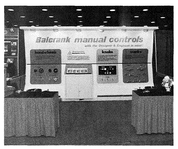
Design Engineering Show — Chicago

Shown here are photos of four of these exhibits featuring Balcrank and Blastrac products. Delta Line and Wheelabrator blast machines were exhibited at other shows but pictures were not available at this time. Next week, the big one — the Foundry Show — will be held in St. Louis. Picture coverage of that show will be included in a future Wheelagram.