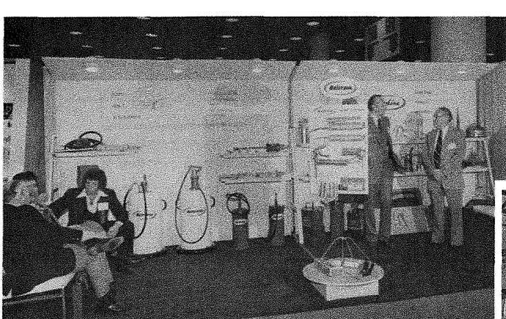
Automotive Service Industries Show — Chicago